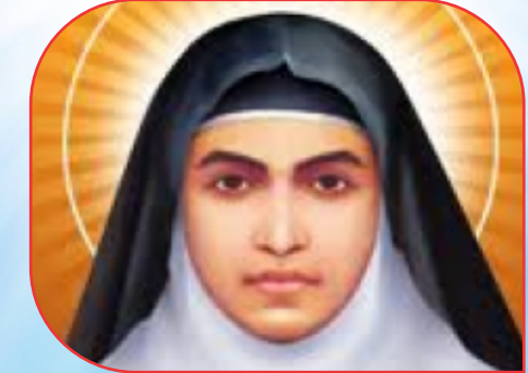
St. Alphonsa (Feast on 28th July)