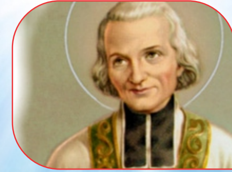
St. John Marie Vianney